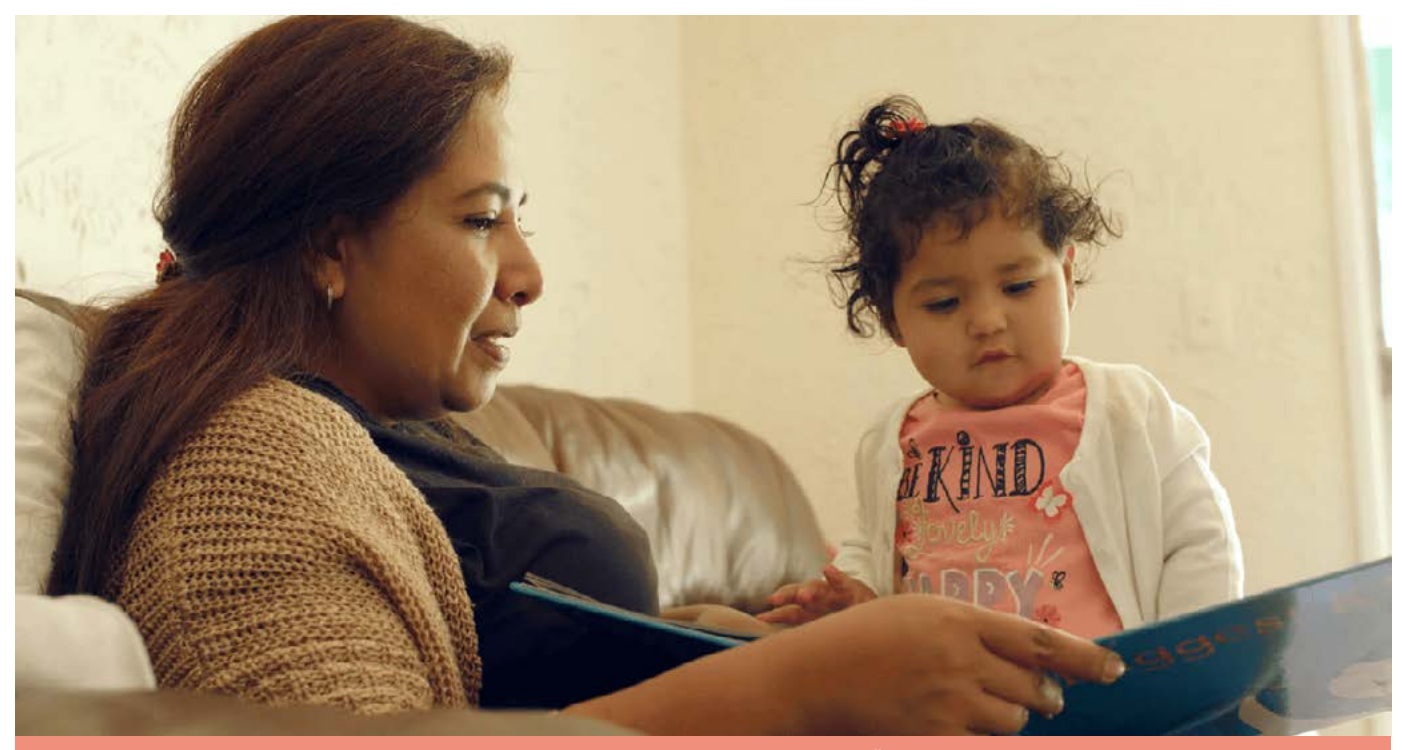
Want to learn more about how to set firm but loving limits? Check out our video "Abuelita: Grandma Sets Limits With Love" and find more tips at <u>talkingisteaching.org/big-feelings</u>