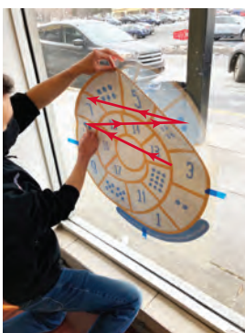
Squeegee in a zig-zag motion, starting at the blue tape continuing upwards.