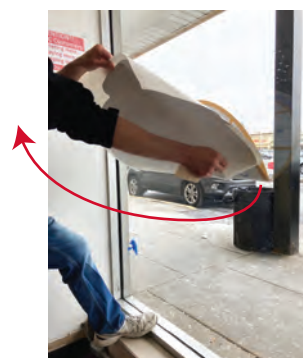
Remove remaining backing paper by folding graphic onto itself bottom up.