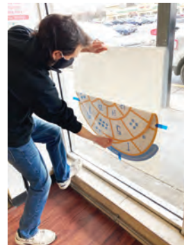
Hold backer paper in one hand and peel graphic with the other.