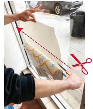
Let graphic hang, face down and make a clean cut right across backer paper.