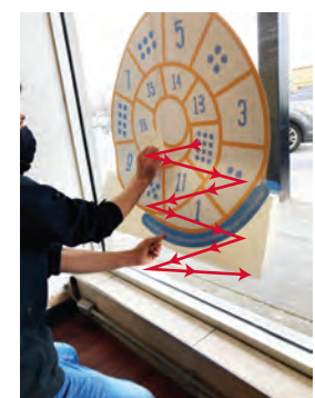
Finish squeegeeing similar to previous side until entire graphic is adhered to the window.